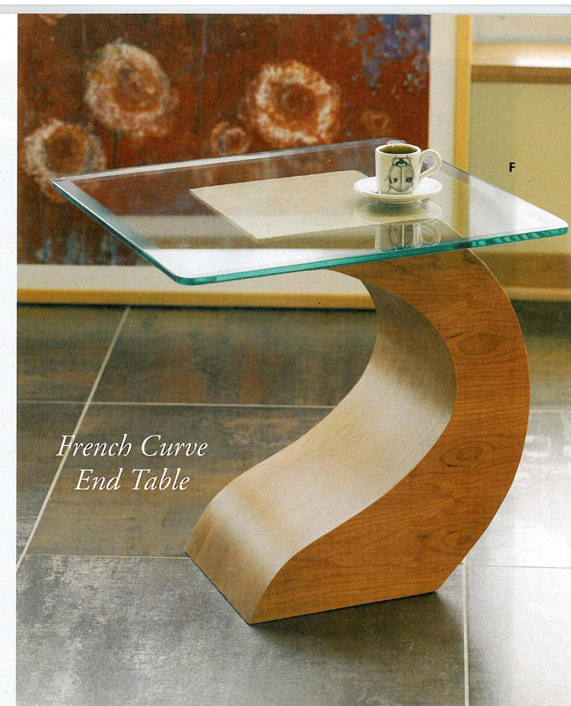
French Curve End Table