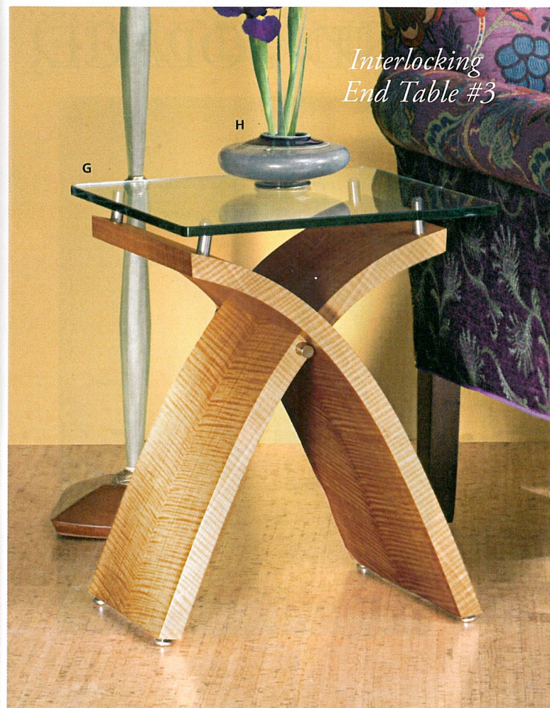
Interlocking End Table #3

by Natalie Blake Hand-rolled tines bristle from the lid of this sculptural porcelain vessel—thrown, carved, and glazed by hand, then fired to 2300 degrees for an antique appearance. Additional vessels available at artfulhome.com. 7" h 8" dia A6169-021 $435 (s+h $28)