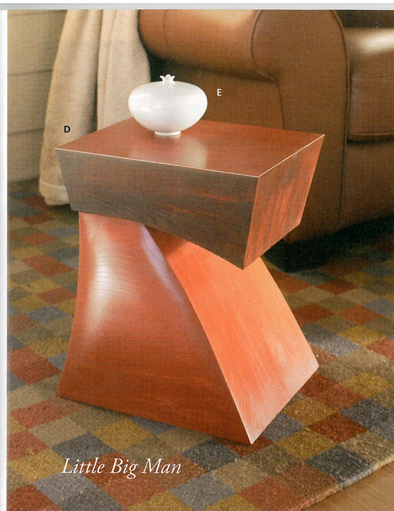
Little Big Man